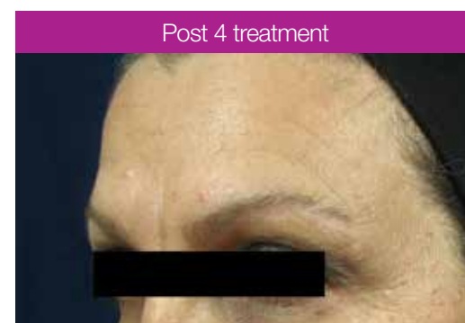
Post 4 treatment